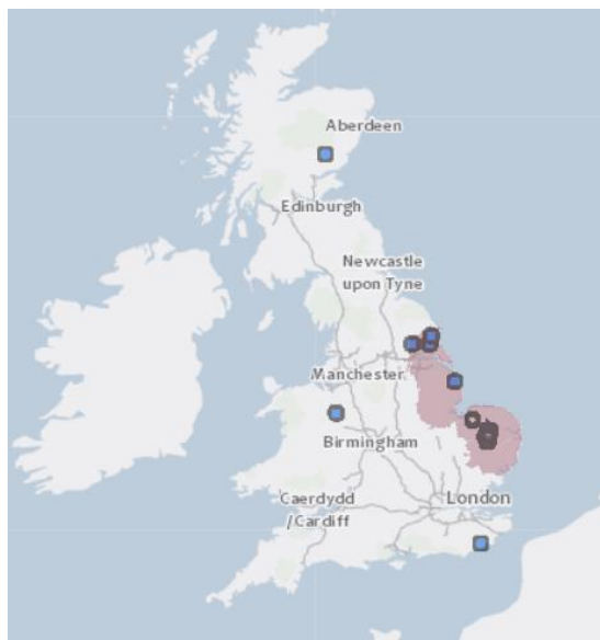
Figure 2. An interactive map indicating current Animal & Plant Health Agency (APHA) HPAI control zones can be found here . The circular areas indicate current disease control zones around infected premises. The purple shaded area indicates the location of AIPZs with housing measures in place.